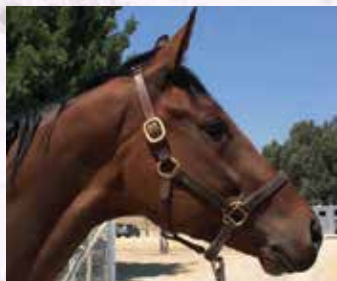
Triple Play Hay