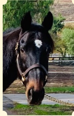
Quick N Dirty